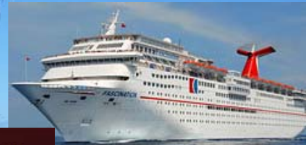
Ship Registry: The Bahamas and Panama